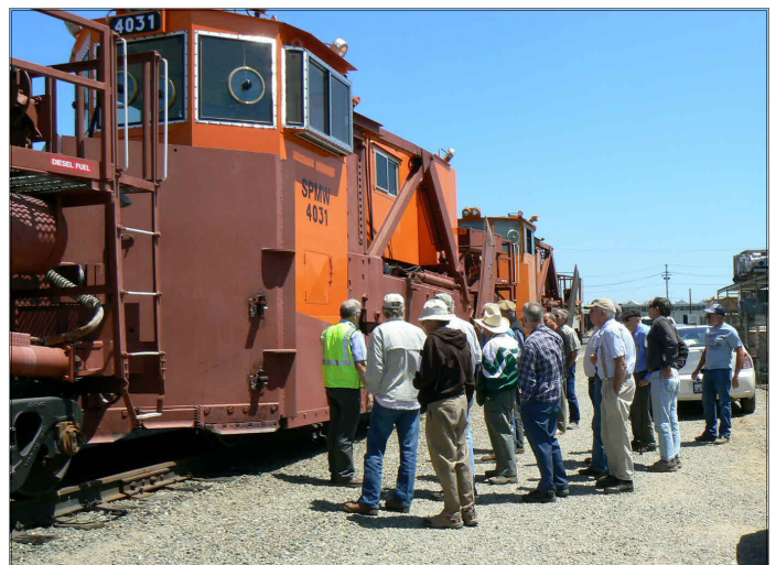
Rebuilt spreaders being viewed on June 2010 PSRHS field trip to the Roseville Yard.