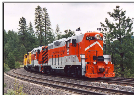
WP museum display train at Spring Garden. The train may appear at 2011 Colfax RR Days.

A commercial video, "UP's Elegant E-9's", available from Pentrex, has footage of these two excursions.