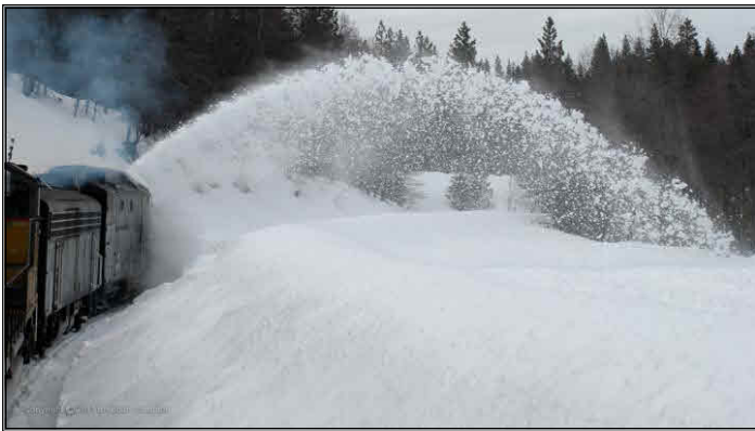
Rotary in Action - April 2011 Brendan Compton

The simplest way to participate is to bring your photos in JPG format on CD or flash drive. We will provide a laptop PC, projector and screen, and DVD player. If you have prepared a slide show using a program such as powerpoint, please be aware that your photos may not display properly unless our computer is running the same software and version. Programs and versions currently supported on our laptop include PowerPoint Viewer 2003 and 2007, Quicktime Player 7, and Windows Media Player 11.