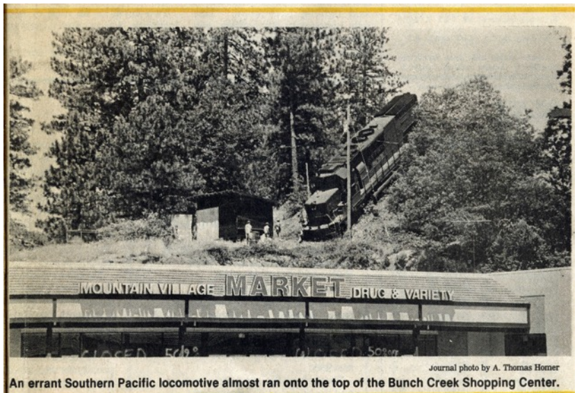
An errant Southern Pacific locomotive almost ran onto the top of the Bunch Creek Shopping Center.