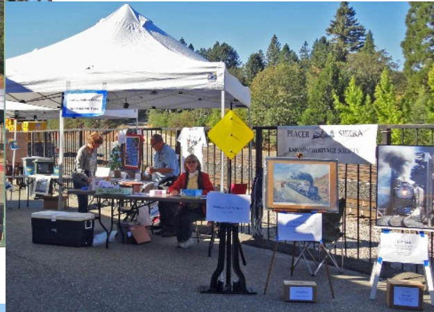
Walt's story time