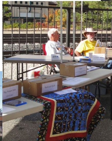
Talkin' 'bout trains