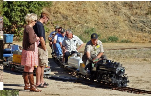
Toy for big boys