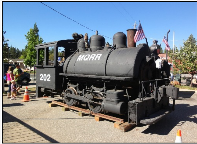
Mountain Quarries Engine #202 at Colfax Railroad Days.