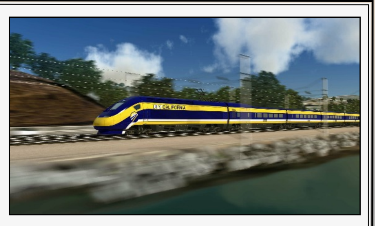
Artist's rendering of California's High Speed Rail system