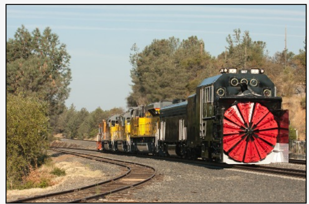
UP's rebuilt rotary is on the move to Colfax Railroad Days. See RR days photos on page 3.