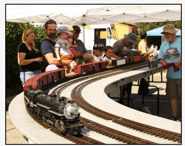
Railfans of all ages enjoyed the live steam model railroad, one of several model layouts on display at Colfax Railroad Days 2014.