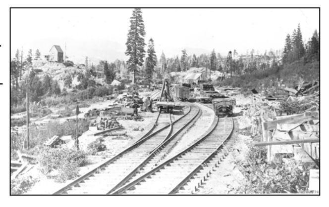
photo was originally provided by Art Sommers for possible identification of the location. While the terrain looks like Donner, the siding and buildings were not familiar. Recently while scanning some of Ken Yeo's slides, the same photo was found in a slide show on PG&E's construction of the increasedheight Spaulding Dam. A siding at Smart (on the mainline near Emigrant Gap) served the construction site. Perhaps some of our intrepid Donner explorers could verify or refute the location of this scene as the former location of the Smart siding.

CPRR/SP Donner Route Timeline: In 1909 SP began grade modifications and double-tracking between Rocklin and Colfax. Two contracts were awarded for the work, one contractor working between Rocklin and Clipper Gap, the other between Clipper Gap and Colfax. To reduce grades, the new roadbed at times deviated from the original tracks, and at other times paralleled or crossed the original mainline, creating major challenges for contractors to ensure daily rail traffic was not interrupted during construction. The new grade resulted in left-hand running on portions of the new mainline, with eastbound traffic using the new #2 track.