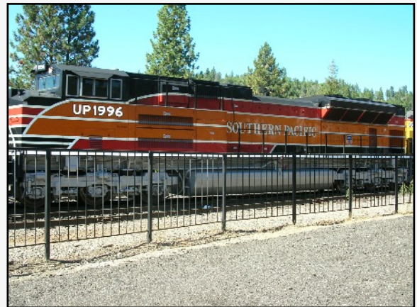
UP 1996, the SP Heritage Locomotive, appeared in Colfax in 2006. See page 3.