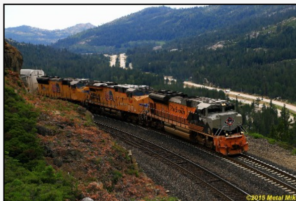
Another UP Heritage Locomotive, UP 1989 D&RGW, appeared on the Donner route in 2015 See larger photo on page 3.