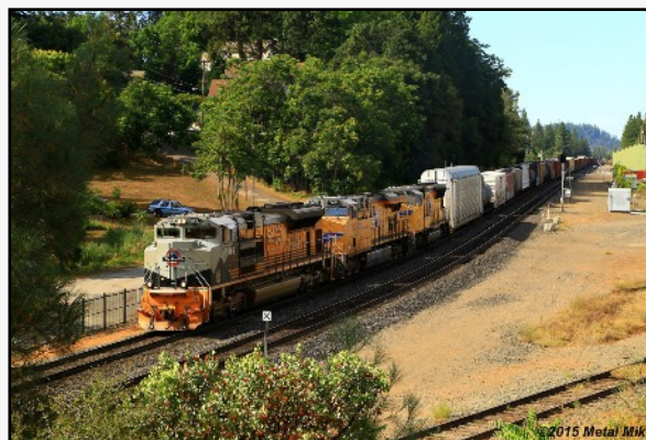
Another view of UP 1989, D&RGW Heritage Locomotive, as it left Colfas. See larger photo on page 3.