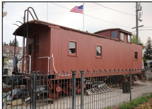
Colfax caboose exterior showing new siding windows, paint and refurbished hardware. More photos on page 3.