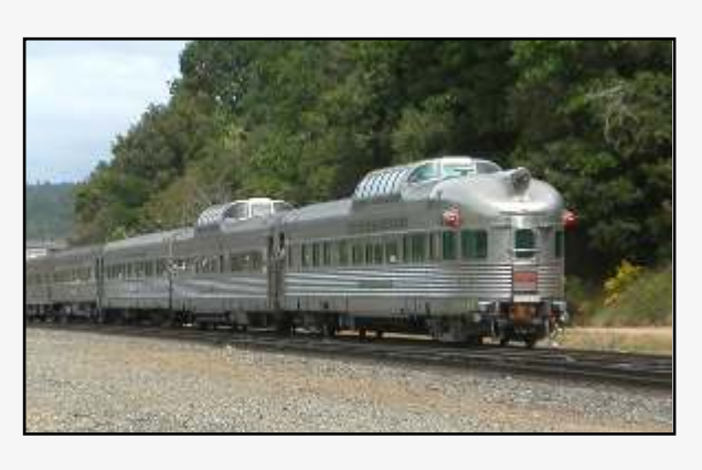
So you want to buy a railroad car – How about one of these? See page 3.