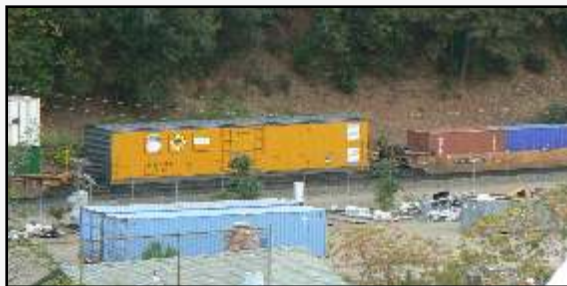
This interesting looking boxcar was spotted in Colfax in 2014. See page 3 for details on its purpose.