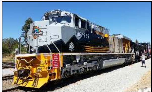
A Union Pacific Heritage Locomotive was the featured guest at this year's Colfax Railroad Days. See page 3 for more photos.