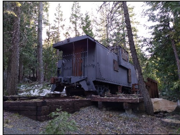
This caboose was spotted on a recent outing in the Sierra. See page 4 for more on this month's mystery image.