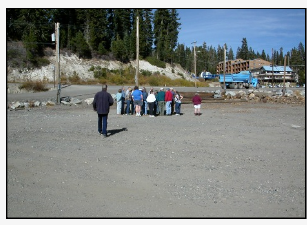
Attendees at a past PSRHS field trip check out the summit turntable ring in the parking lot across from Donner Ski Ranch. Look for details on our Oct. 19 field trip to Donner Summit in the September newsletter.