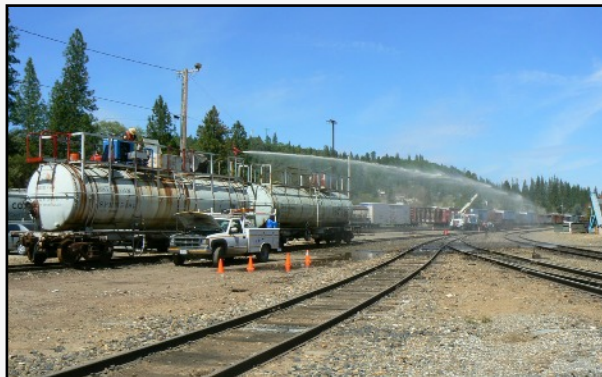
This equipment test was spotted in the Colfax Yard in 2007. See the story on page 3.