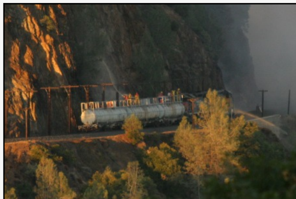
A contemporary fire train in action. See photos and story on page 3.