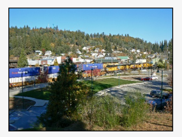
Double stacks are relatively new on the Donner Route. This image captures the first double stack train to traverse the route. See story on page 3