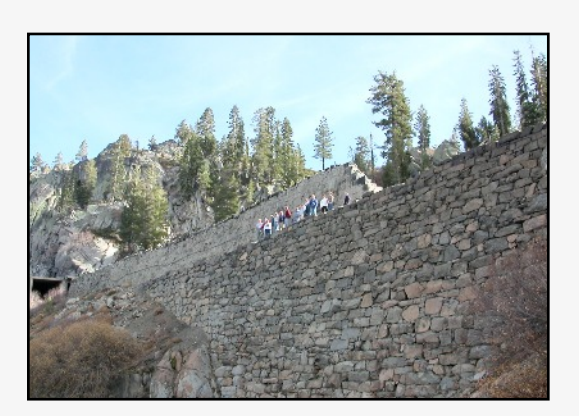
The China Wall and Summit tunnels are a visual testament to Central Pacific's Chinese workers. Our August Zoom program explores the Chinese legacy at Donner Pass. See page 2.