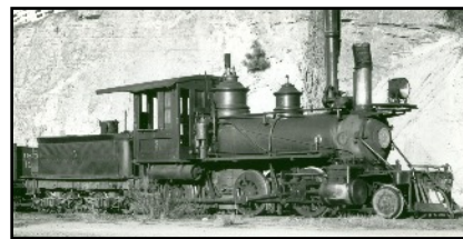
NCNG #5

The dedicated volunteers at the Nevada County Narrow Gauge Railroad Museum have been busy restoring NCNG #5 to operating condition in preparation for showing it at the Great Western Steam Roundup. A new boiler was installed and in late May #5 steamed again for the first time since being brought to the museum for static display. By the time this newsletter is distributed #5 should be in Carson City ready to be operated alongside its sister locomotive Glenbrook.