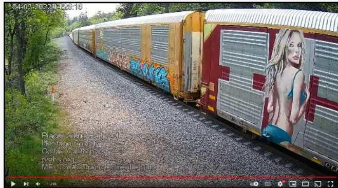
Railroad graffiti or art? See page 3. Image from PSRHS Web-cam.

Geological Field Trip on the Amador Central Railroad. Pages 5-6