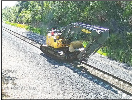
Maintenance of Way equipment caught on camera on the Donner Route. See page 3