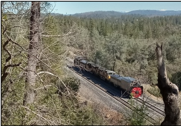
Rotary set approaching Colfax from crossover west of town, viewed from Tokayana Way

On Feb. 8 your editor was standing at the overlook on Tokayana Way near the crossover west of Colfax and heard the slow approach of an engine. Much to my surprise the Roseville rotary set soon passed by heading toward Colfax on the #2 track (top left photo). Knowing the rotaries can't clear the Colfax Amtrak platform on #2 without removing sections of the platform, we hi-tailed it to Colfax in time to watch the rotaries back into the siding by the depot for the night (top right). Early the next morning they headed up the hill for snow clearing and training along with a spreader crew from Truckee. PSRHS member Mike Haire captured the lower two photos near Troy showing a spreader and rotary in action.