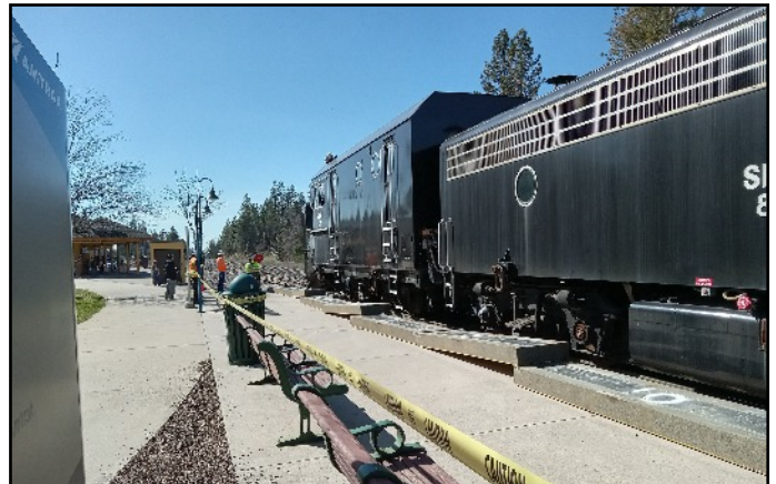
Backing into siding by Colfax depot. Amtrak platform sections were removed to provide clearance for rotaries