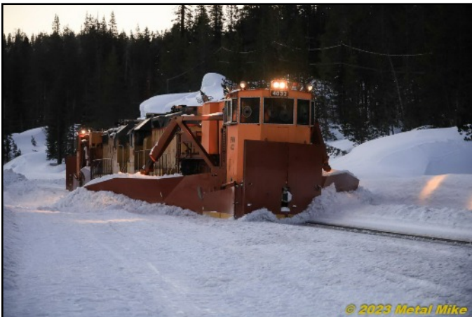
Spreader pushing snow from the core between the tracks onto the #2 track.