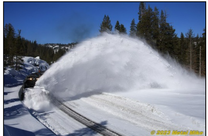
Rotary doing what it does best, throwing the snow well clear of the tracks.