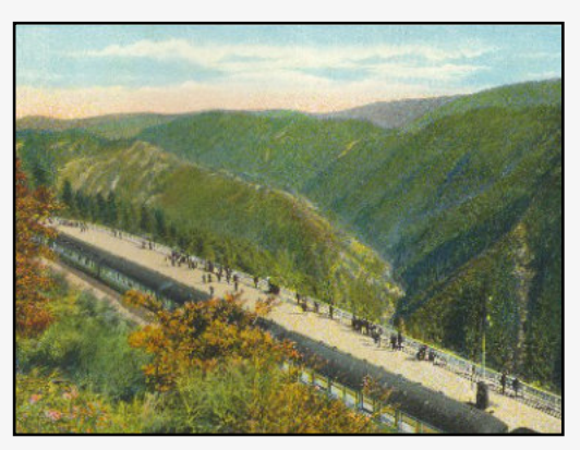
Southern Pacific's observation platform that was opened in 1916 at American is featured in this month's newsletter. See page 2, 4 and 5.