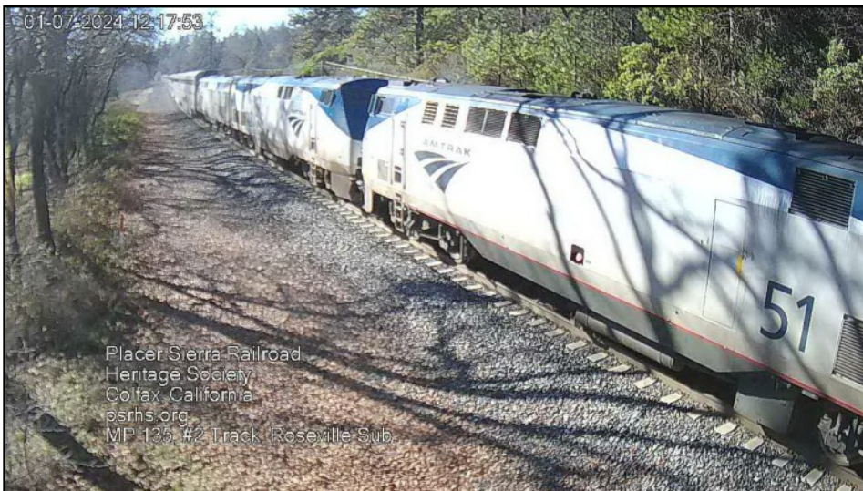
Image from PSRHS Applegate Web Cam