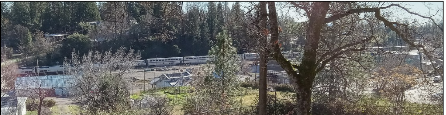
Upper Photo by Roger Staab Note baggage car visible through fork of tree

Those of us living near the railroad tracks get treated to the occasional unique view of railroad operations. On January 7 eastbound and westbound AMTRAK #5 & #6 met in Colfax. This happens occasionally as their scheduled times in Colfax are less than an hour apart. This time, though, as #5 began clearing the Grass Valley Street crossing, the view from my deck gradually revealed more and more cars on #6. Final tally – 4 locomotives followed by 5 passenger cars, then a single baggage car, followed by 7 (my count) or 8 (Jim Wood's count) more passenger cars. Each section included a dining and observation car. Apparently #6 was canceled on January 6, leaving two train sets in Emeryville to make the combined January 7 eastbound run.