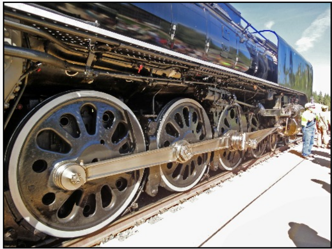
UP 844 at Colfax, October 4.