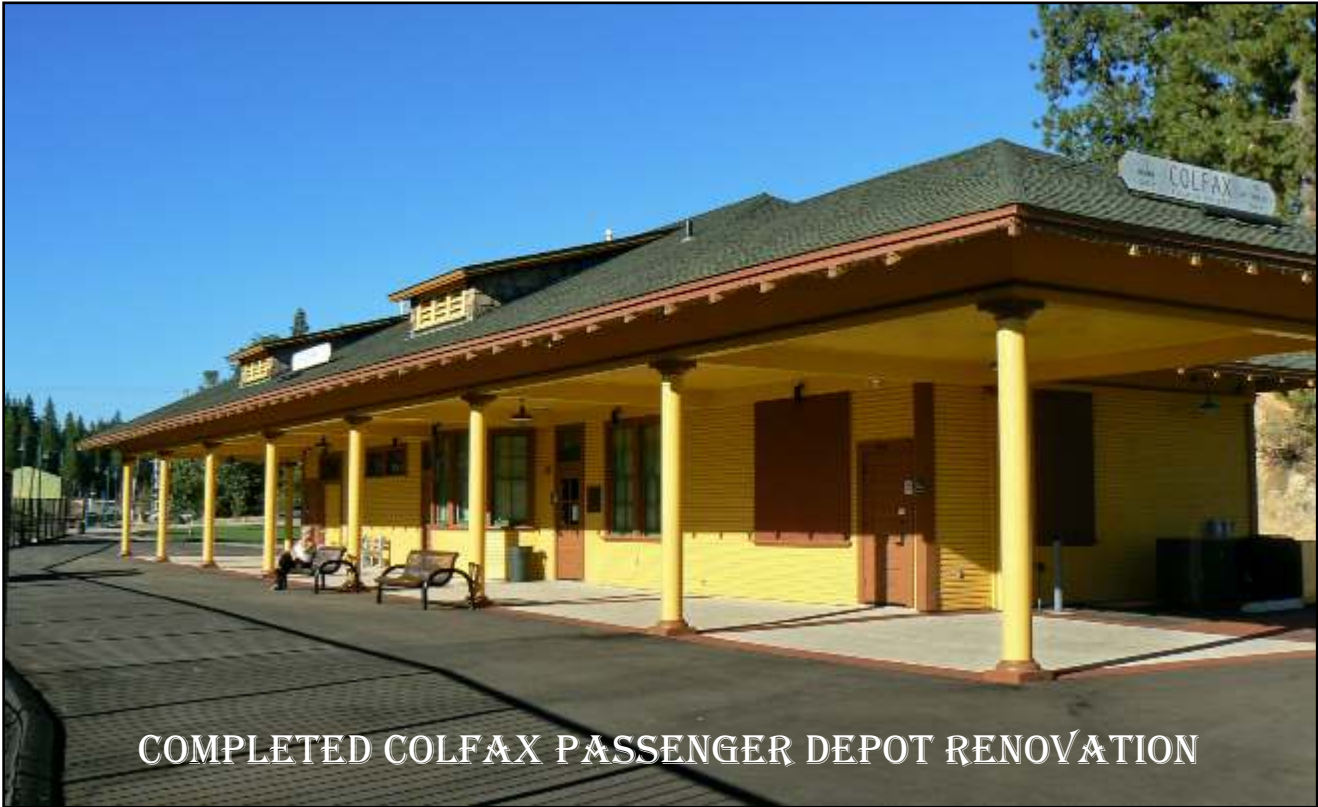
COMPLETED COLFAX PASSENGER DEPOT RENOVATION