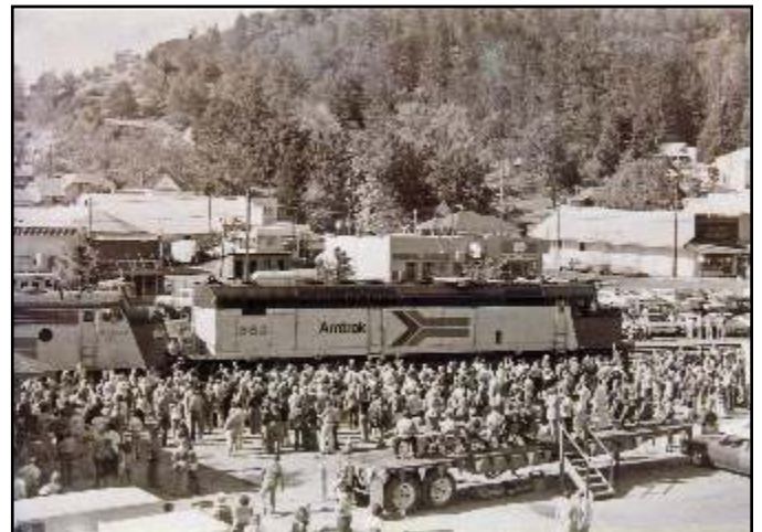
At left, after AMTRAK took over operation of passenger trains in 1971, the Colfax Passenger Depot became offices and storage for railroad maintenance and operations. AMTRAK reestablished the Colfax stop in 1976 (right), but the depot was not made available for AMTRAK passengers.