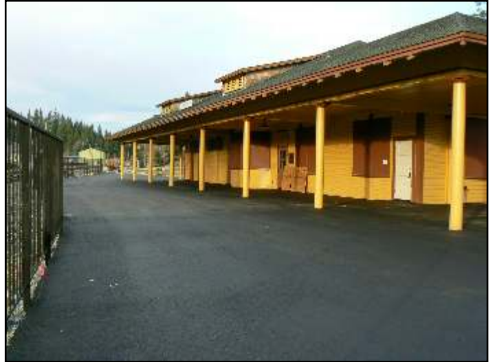
Contractor performing grading and asphalt installation in the area surrounding the depot.

As a final finishing touch, the project paid to have the asphalt under the colonnade treated with street print, a process that imprints the asphalt with a segmented and colored appearance, in this case mirroring the construction details in the underside of the colonnade above. Benches were purchased to provide a place next to the building where passengers could relax in the shade of the colonnade while waiting for the train. Tables and chairs were also purchased for the waiting room.