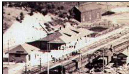
In 1905 the original Central Pacific depot burned. That year the Freight depot (upper center in photo at left) was moved to the area vacated by the CP depot. The new Colfax Passenger Depot (far upper right and inset above) was built that year east of the SP tracks and south of Grass Valley Street, where it still sits to this day.

The 1905 SP passenger depot was built in SP's colonnade style. It was constructed of redwood framing and siding. Along the side of the building facing the SP tracks was a colonnade or covered arcade supported by cast iron columns. The colonnade extended beyond the building itself at each end. SP tracks at that time ran parallel to the building and were readily accessible to passengers, but that would change with time.