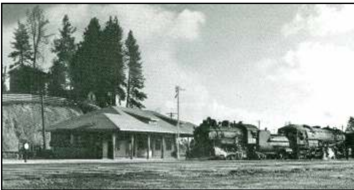
In this photo from the early 1940's, an eastbound Southern Pacific cab-forward locomotive pauses in front of the Colfax Passenger Depot. A Colfax-based helper locomotive has been added in front of the big cab-forward. The helper will provide added power for the heavy grades between Colfax and Emigrant Gap.

Southern Pacific Railroad experienced increased passenger service through Colfax in the early 20 th century. The passenger depot was a beehive of activity, serving numerous trains from both sides of the building. Freight trains became more numerous as well, and the depot served as office support for both passenger and freight trains. Starting in the teens, Colfax began to see more of the huge cab-forward steam locomotives that remained a fixture on the line until the early 1950's. Colfax was a watering stop for the thirsty Eastbound locomotives as they climbed the grades toward Donner Summit. Special Presidential trains or those carrying other dignitaries stopped at Colfax to take on water. From 1915 until the late 1940's Colfax was also home to a fleet of helper locomotives. Their crews and support personnel operated out of the Colfax engine house and the passenger depot.