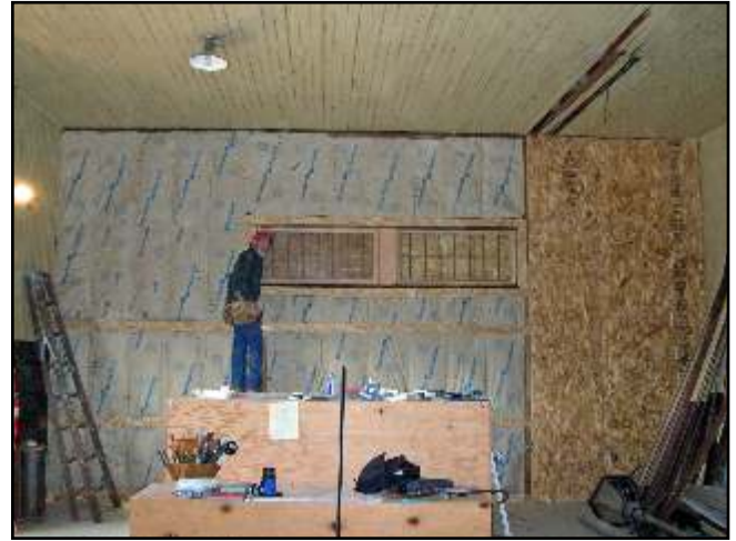
In the photos above, the north wall of the baggage room required the addition of a section of plywood sheer wall to meet earthquake standards. The beaded tongue-and-groove boards were removed from the entire wall and insulation added along with shear plywood at far right corner and nailing strips.

A new double-doorway was cut between the baggage room and former railroad office. The original drawings called for this to be an open passageway between two parts of the library but now the opening was framed to be a lockable set of doors between the museum and visitor center. Original drawings called for the large sliding freight door on the track side to be secured in the open position and a new doorway and window installed in the opening. To preserve the historical look of the building, the sliding freight door was left intact and its hardware reconditioned so it would close and open smoothly. This later proved useful when moving large display cases into the museum. To meet the requirement for two exits from any room, the opening for a new doorway was cut at the corner of the building adjacent to the sliding door, and framed so its exterior appearance matched the other exterior doors.