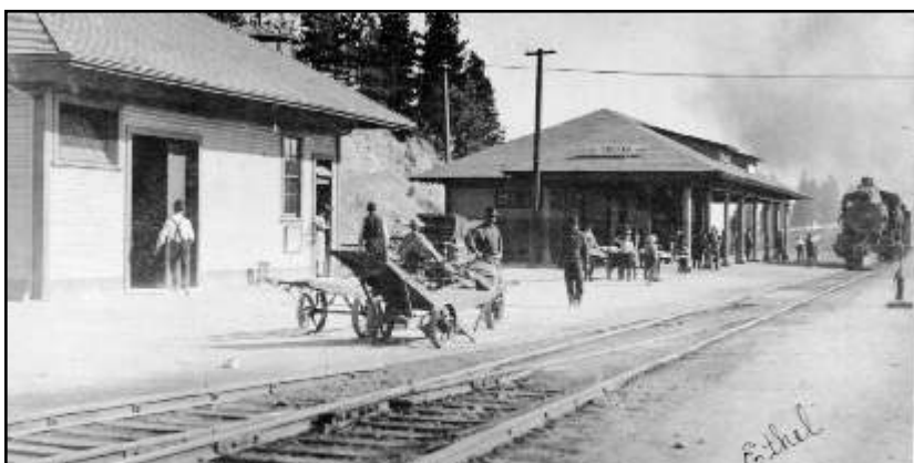
From 1905 until about 1914, the Colfax Passenger Depot was parallel to the mainline tracks and just south of the Wells Fargo (later Railway Express) building. NCNG tracks ran behind both buildings along Railroad Avenue.

The 1905 SP passenger depot was built in SP's colonnade style. It was constructed of redwood framing and siding. Along the side of the building facing the SP tracks was a colonnade or covered arcade supported by cast iron columns. The colonnade extended beyond the building itself at each end. SP tracks at that time ran parallel to the building and were readily accessible to passengers, but that would change with time.