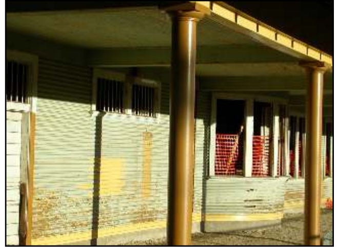
Above - Depot building back on new foundation with repairs where siding was penetrated to move it or removed to bolt it to foundation. Below - Depot building after exterior was prepped and painted.