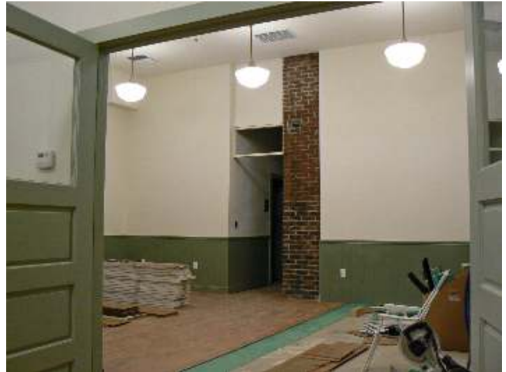
Above, sheetrock was installed in visitor center (left) and waiting room (right). Original brick chimneys were preserved and period light fixtures added. Below, Finishing touches in the visitor center include a custom desk and telegrapher equipment (left). Waiting room (right) includes photo displays and custom art.