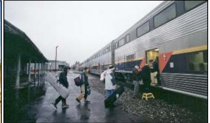
The first Capitol Corridor train to overnight in Colfax arrived to fanfare in January 1998 (left). Above, the train prepares for an early morning departure near the Colfax depot building in 1999.

In parallel with inaugurating this new service, Placer County began a project to establish stations along the new expanded route. Negotiations were begun with Southern Pacific, continuing with Union Pacific when that company acquired the Southern Pacific holdings. A memorandum of understanding (MOU) was reached in 1996 between UP and the affected communities that promised the transfer of properties along the route for the purpose of establishing Capitol Corridor stations. Included in this MOU was the transfer of the Colfax Passenger Depot to the City of Colfax. The deed of transfer was executed in 1998, with the City of Colfax receiving ownership of the Passenger Depot and most of the land under it between the tracks and Railroad Avenue, with the exception of a 50-foot strip between the tracks and the building. That strip was instead leased to the City. Also included in the deed transfer was the parcel now occupied by the Colfax caboose and the Roy Toms Plaza gazebo and parking.