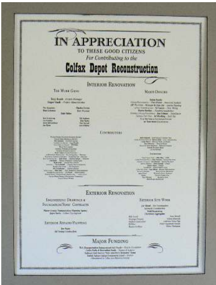
A framed poster mounted in the depot waiting room honors the many volunteers, contractors and donors who helped make the depot renovation project a success.