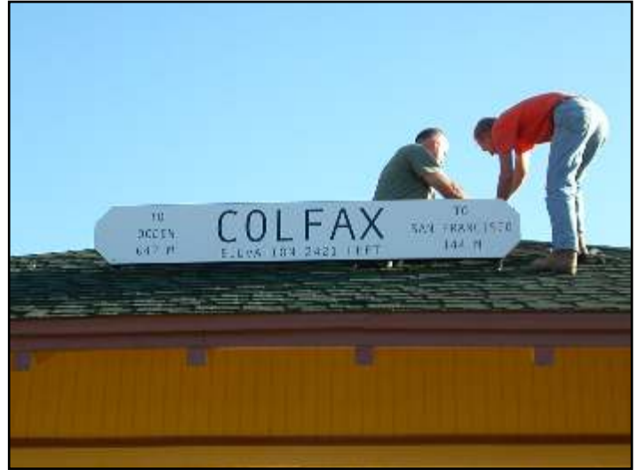
At left, residue from old plaster and sheetrock wall and ceiling coverings had to be removed from framing members by volunteers before new work could begin. At right, volunteers researched, procured and installed new roof signs for Colfax station consistent with historical signage..

The first funding break came when the Colfax Area Historical Society secured a $50K grant from United Auburn Indian Communities. That support was based on the promise to feature regional Native American history in the planned museum. The grant required matching funds in the form of volunteer labor and donations. The City Parks and Recreation Commission added $75K toward the project, recognizing the public recreation associated with the planned use of the building.