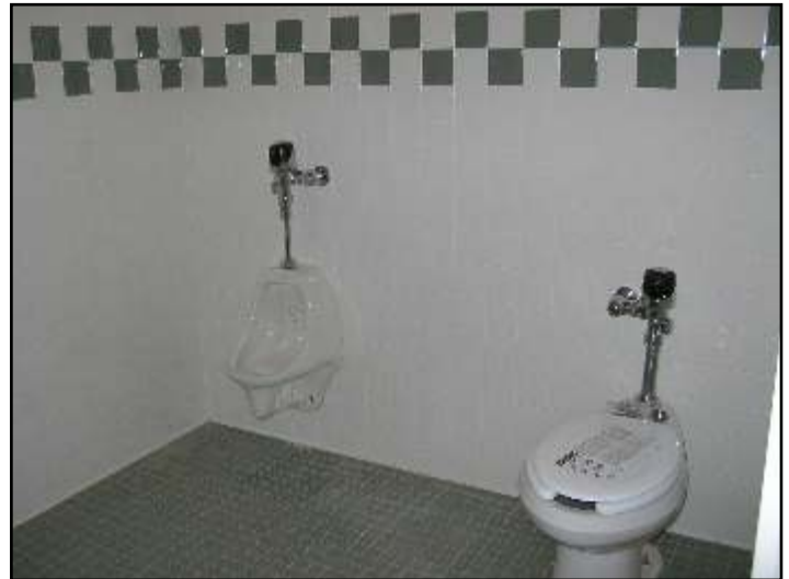
Left - Donated bath tile installation underway. Right - Completed tile work and installed plumbing fixtures.

Custom wood doors were procured that closely matched period doors that would have been used in the early 1900's. The doors were painted and fitted with modern door hardware and closers that satisfied ADA requirements for public access. All four of the exterior doors providing public access were made ADA compliant. New transom windows were fabricated to match the one surviving original and installed above the new doors. Period light fixtures were installed near the doors on the street side, and period pendant lights installed under the colonnade. A security system was also installed with keypad-controlled access at doors in each room. A locksmith donated his time to key the locks.